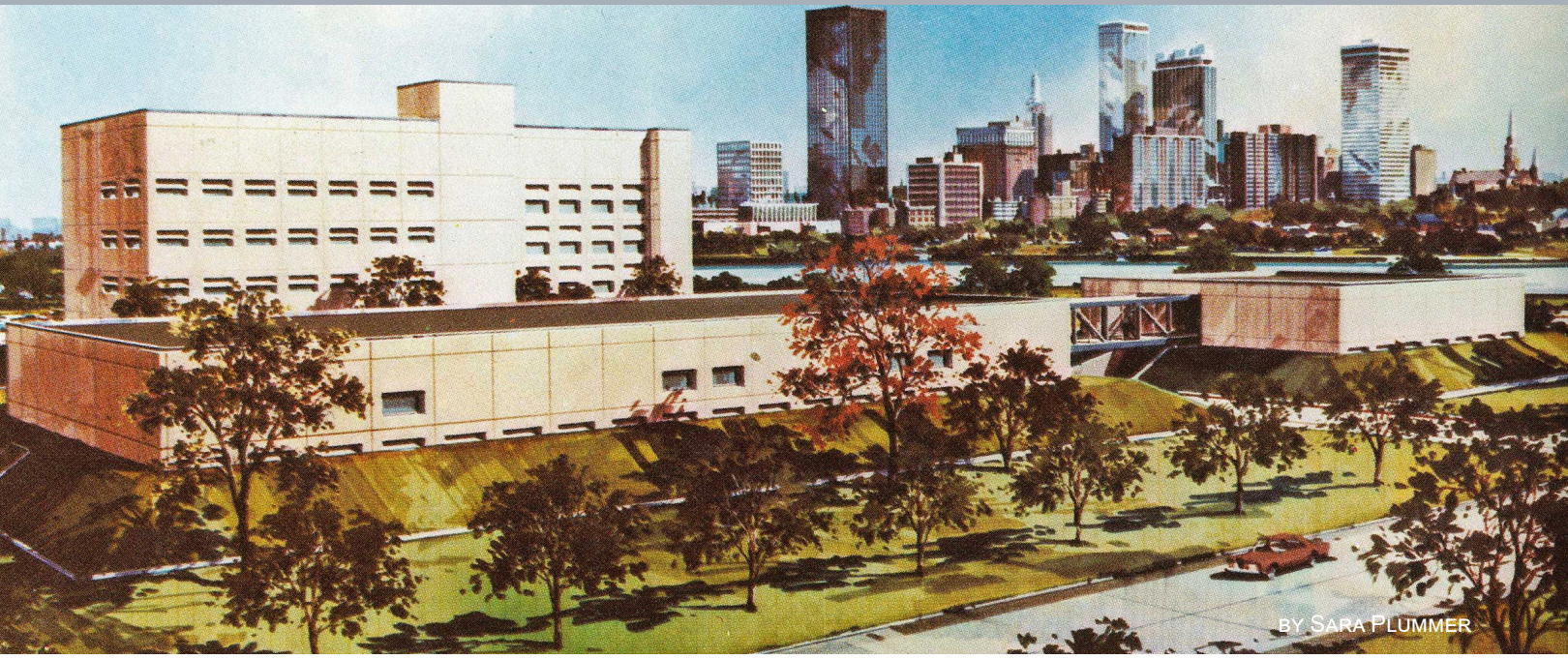
Original rendering from 1976 of the Oklahoma College of Osteopathic Medicine and Surgery that would later become OSU College of Osteopathic Medicine.

Fifty years ago, Oklahoma was dealing with a physician shortage so state leaders came together to create and pass Oklahoma Bill 461 that established the Oklahoma College of Osteopathic Medicine and Surgery in Tulsa, which later became the OSU College of Osteopathic Medicine.